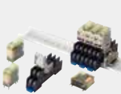
RF2 force-guided relay (2-pole)

Can be used as interface relays to send input signals to a controller, or to amplify current for driving a contactor.