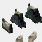
RF1V force-guided relay (4-pole/6-pole)

Can be used as interface relays to send input signals to a controller, or to amplify current for driving a contactor.