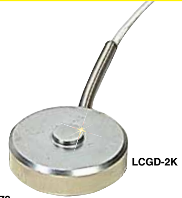
Shown actual size.