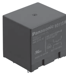
Form A type also available with 48A contact capacity

Refer to data sheet, starting on page 9 .