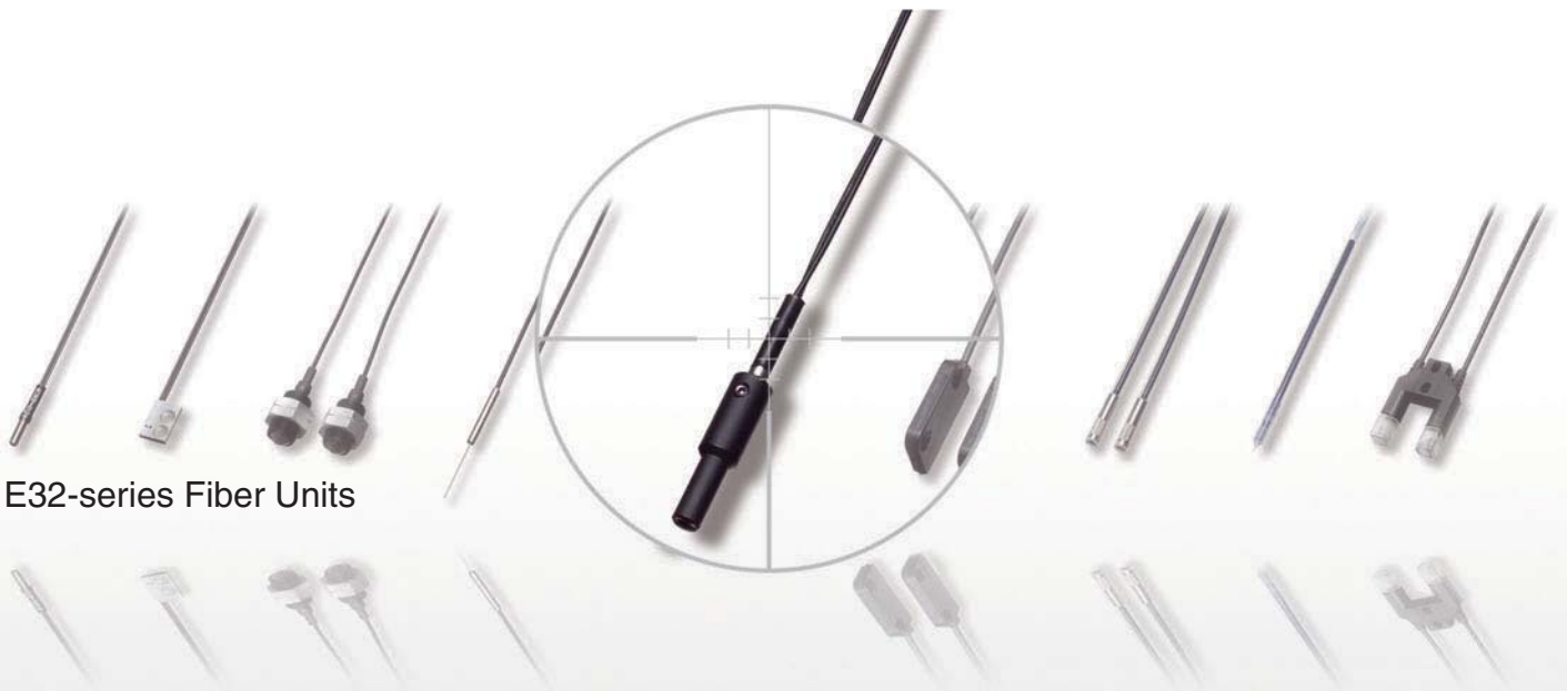
E32-series Fiber Units

This catalog brings you the latest information on our Fiber Units.