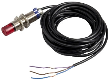
photo-electric sensor - XUB - receiver - 90° - Sn 15m - 12..24VDC - cable 2m