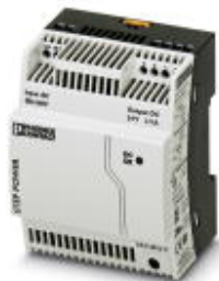
Primary-switched STEP POWER power supply for DIN rail mounting, input: 1-phase, output: 24 V DC/2.5 A

Please be informed that the data shown in this PDF Document is generated from our Online Catalog. Please find the complete data in the user's documentation. Our General Terms of Use for Downloads are valid ( http://phoenixcontact.com/download )