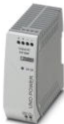
Primary-switched UNO POWER power supply for DIN rail mounting, input: 1-phase, output: 24 V DC/60 W

Please be informed that the data shown in this PDF Document is generated from our Online Catalog. Please find the complete data in the user's documentation. Our General Terms of Use for Downloads are valid ( http://phoenixcontact.com/download )