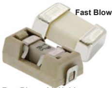
Fast Blow with Holder