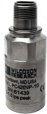
Table 1: PC420Vx-yy model selection guide

Wilcoxon's PC420V series sensors provide a 4-20 mA output proportional to velocity vibration, allowing for continuous trending of overall machine vibration. This trend data alerts users to changing machine conditions and helps guide maintenance in prioritizing the need for service. The choice of RMS or peak output allows you to choose the sensor that best fits your requirements.