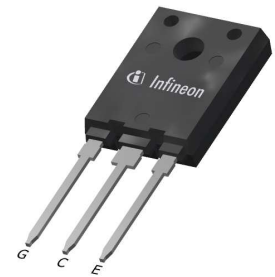
Fully isolated package TO-247