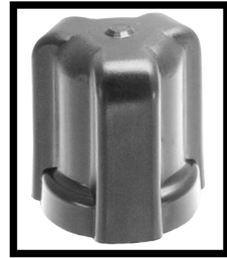
Switch Boot P/N 79380 for Vacuum and Pressure

Type: Direct action blade contact Contacts: Silver alloy, gold plated Set Point: Factory set from 0.5 to 150 PSI Operating Pressure: 150 PSI for 0.5-24 PSI set point range, 250 PSI for 25-150 PSI set point range Proof Pressure: 500 PSI Burst Pressure: 750 PSI for 0.5-24 PSI set point range, 1250 PSI for 25-150 PSI set point range.