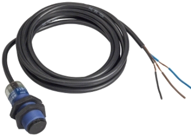
photo-electric sensor - XUB - receiver - Sn 15m - 12..24VDC - cable 2m