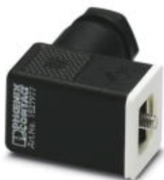
Valve connectors, Universal, 4-position, Valve connector CI (9.4 mm), Screw connection, cable gland Pg9, external cable diameter 4 mm ... 6 mm

Please be informed that the data shown in this PDF Document is generated from our Online Catalog. Please find the complete data in the user's documentation. Our General Terms of Use for Downloads are valid ( http://phoenixcontact.com/download )