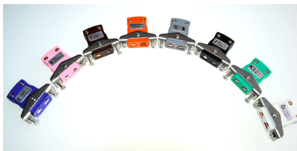
'Stainless steel panel mounting bracket'