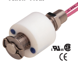
LS-1700 Series – Teflon® Float