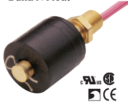
LS-1700 Series – Buna N Float