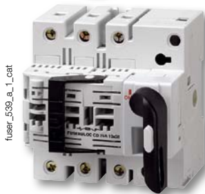
FUSERBLOC 20 to 32 A