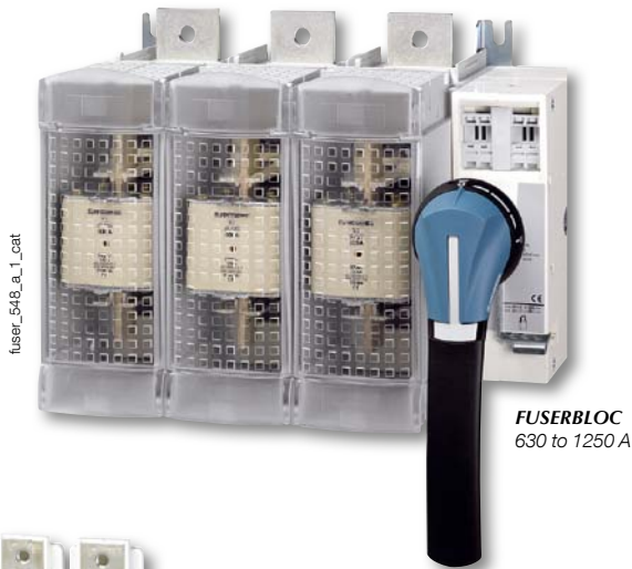
FUSERBLOC 630 to 1250 A