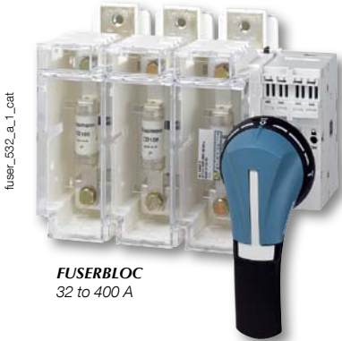
FUSERBLOC 32 to 400 A