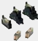
RF1V force-guided relay (4-pole/6-pole)

Can be used as interface relays to send input signals to a controller, or to amplify current for driving a contactor.