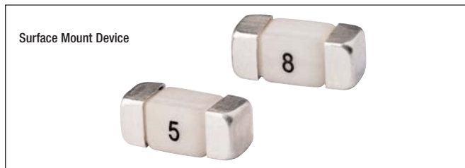
Surface Mount Device