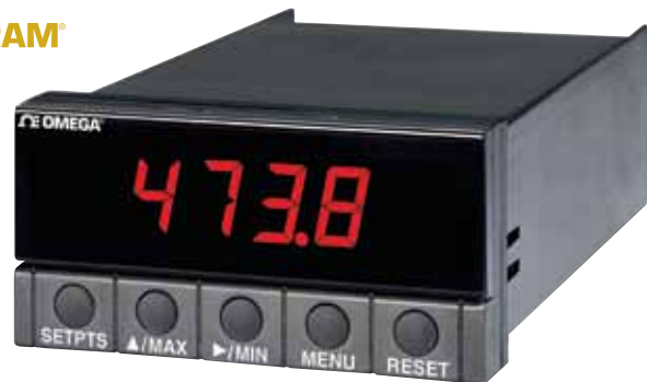
DP25B-E, shown smaller than actual size.