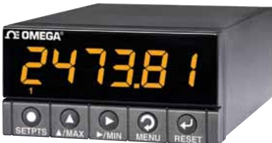
DP41-B, shown smaller than actual size.