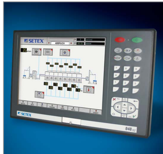
SECOM 848 TC

The SECOM 848 TC can be used as a stand alone controller as well as in a Windows® network environment under the machine management software OrgaTEX.