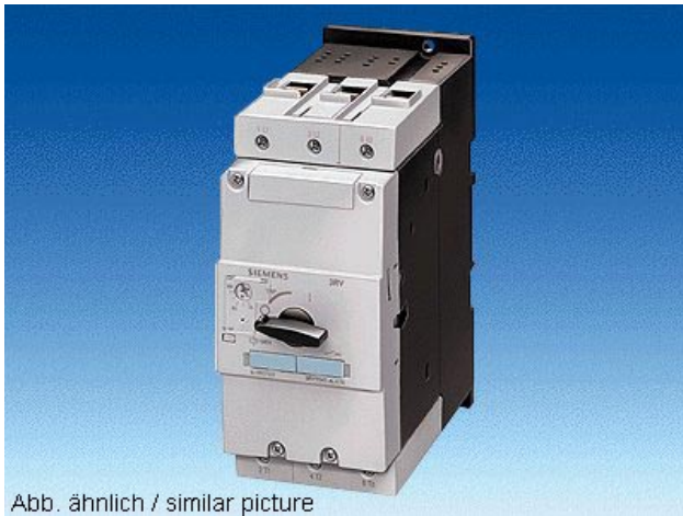
Abb. ähnlich / similar picture

CIRCUIT-BREAKER SIZE S3, FOR MOTOR PROTECTION, CLASS 10, A-REL. 45...63A, N-REL. 819A, SCREW TERMINAL, STANDARD SWITCHING CAPACITY