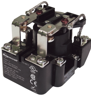
199 Series Relay