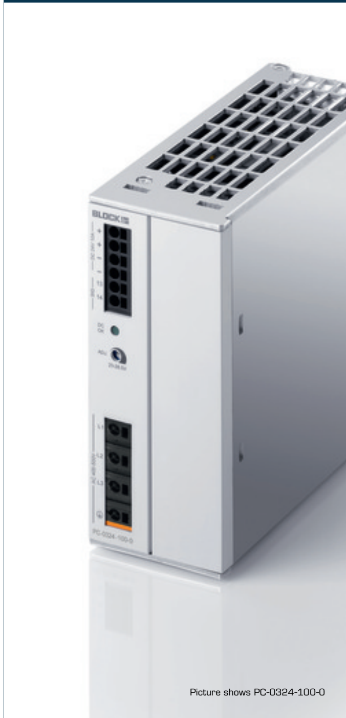
Picture shows PC-0324-100-0