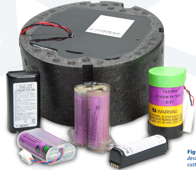
Figure 1: Upon request, Tadiran designs, tests, and manufactures customized battery packs.

The design and assembly of battery packs require special skills, expertise and experience. Therefore it is not recommended that the end user attempt to self-assemble battery packs. It is preferable that any battery using lithium cells be fabricated by Tadiran to ensure proper battery design and construction (see <u>figure 1</u>). A full battery assembly service is available from Tadiran who can be contacted for further information. If for any reason, this is not possible, Tadiran can review the pack design in confidence to ensure that the design is safe (in assembly and use) and capable of meeting stated performance requirements.