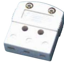
Miniature uncompensated version male and female shown actual size.