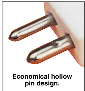
Economical hollow pin design.

We make running changes when technical advances allow. Check at time of ordering for additional features.