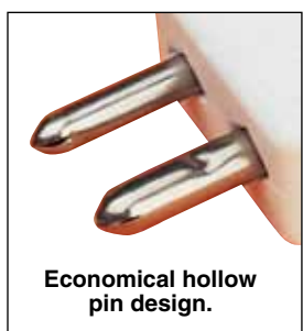
Economical hollow pin design.

We make running changes when technical advances allow. Check at time of ordering for additional features.