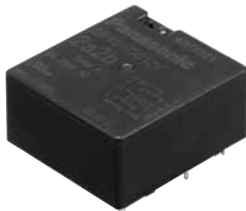
4-pole (2 Form A 2 Form B, 3 Form A 1 Form B)