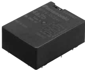
6-pole (4 Form A 2 Form B, 5 Form A 1 Form B)