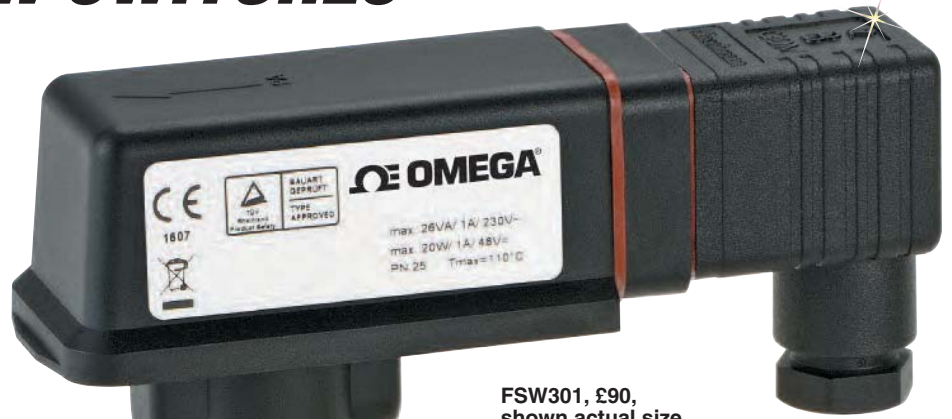
FSW301, £90, shown actual size.

Ordering Example: FSW301, insertion style flow switch and 70A-2, fast pulse tone alarm, £90 + 10.75 = £100.75