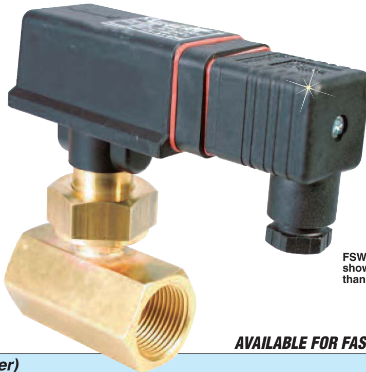
FSW304, £95, shown smaller than actual size.

Material of Construction: Brass body, pipe section and paddle system