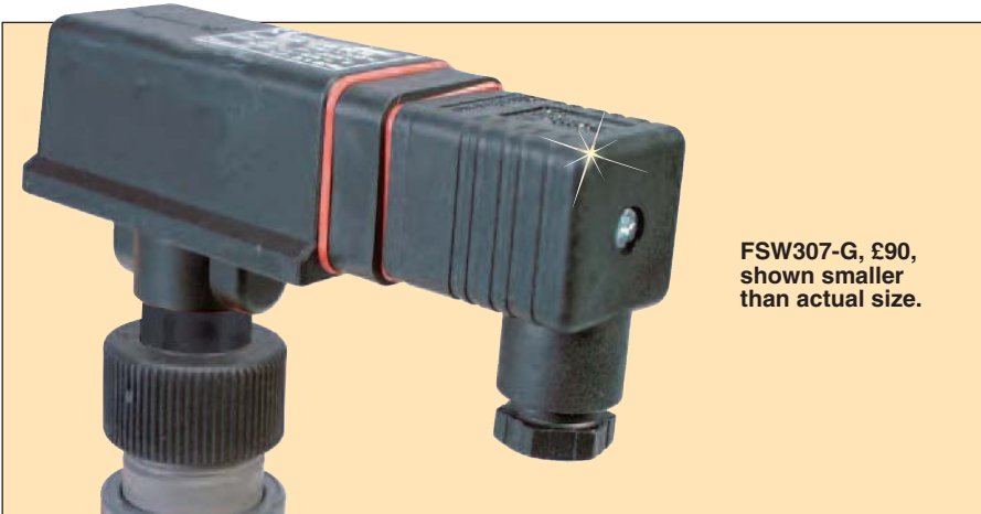
FSW307-G, £90, shown smaller than actual size.

Ordering Example: FSW303-G, inline flow switch, 3/4" brass NPT connection, 70A-2, audible alarm, £95 + 10.75 = £105.75.