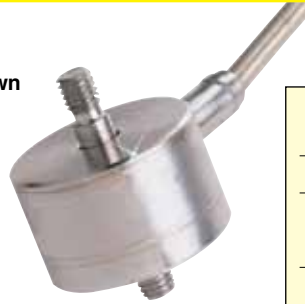
LCFD-100, shown actual size.