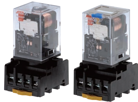
For the most recent information on models that have been certified for safety standards, refer to your OMRON website.