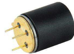
Isolating Cover Option