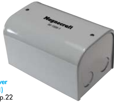
Optional Cover (50-1289-1) See Section 3 p.22