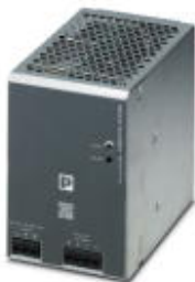
Primary-switched ESSENTIAL POWER power supply for DIN rail mounting, input: 1-phase, output: 24 V DC / 480 W

Please be informed that the data shown in this PDF Document is generated from our Online Catalog. Please find the complete data in the user's documentation. Our General Terms of Use for Downloads are valid ( http://phoenixcontact.com/download )