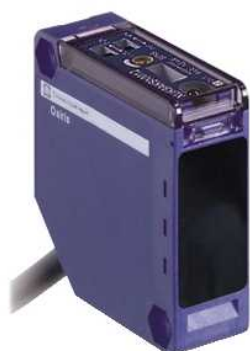
photo-electric laser sensor - XUK - BGS - Sn 1m - 12..24VDC - cable 2m