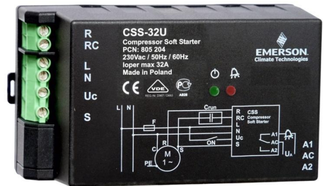
CSS-32U Soft Starter