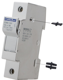
CMS8010PAK + fuse-holder