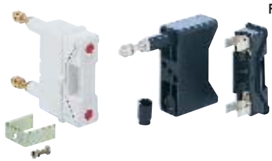
Front / Back stud connected Back stud connected flush mounted