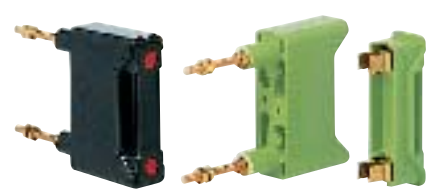
Back stud connected