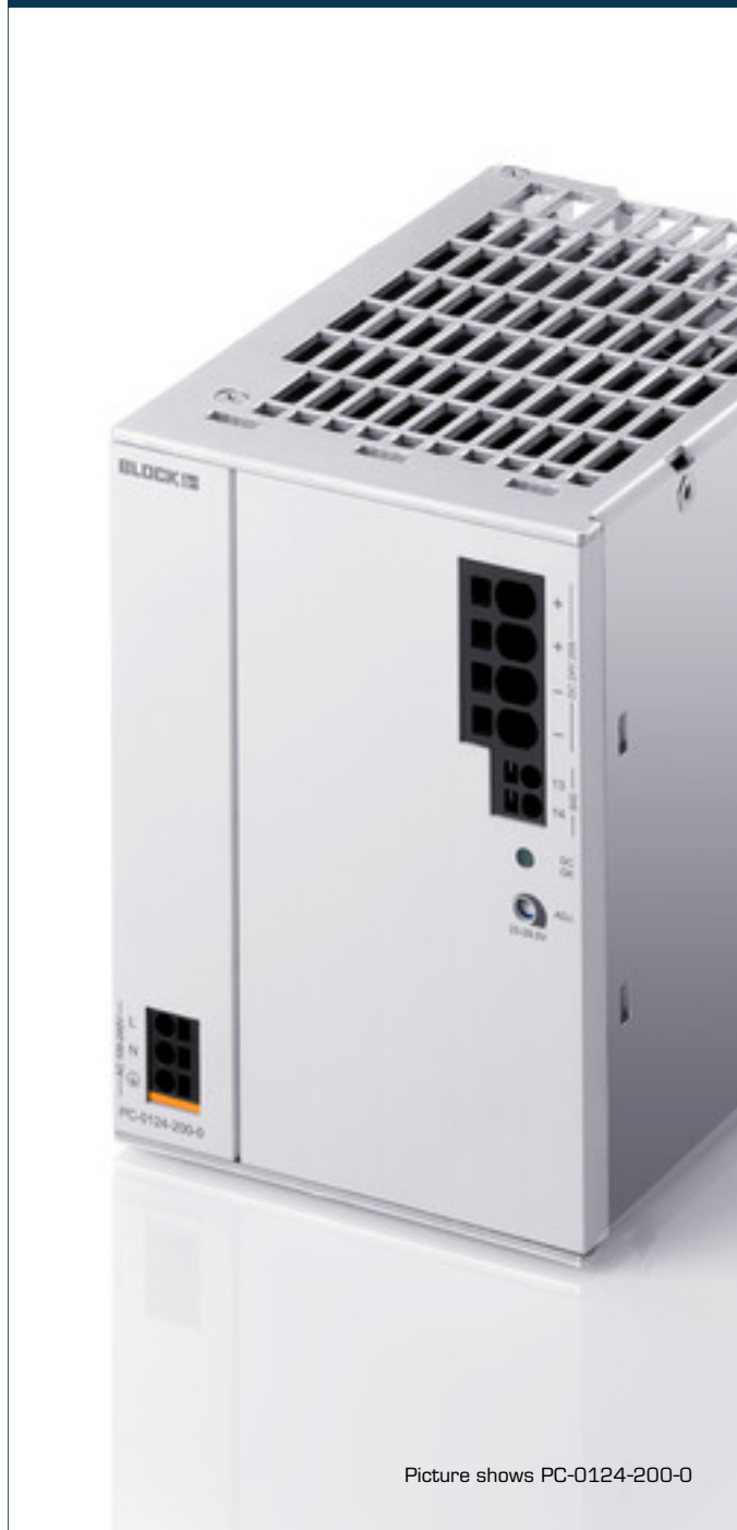
Picture shows PC-0124-200-0