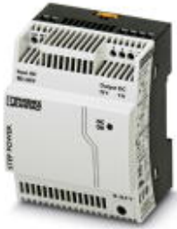
Primary-switched STEP POWER power supply for DIN rail mounting, input: 1-phase, output: 15 V DC/4 A

Please be informed that the data shown in this PDF Document is generated from our Online Catalog. Please find the complete data in the user's documentation. Our General Terms of Use for Downloads are valid ( http://phoenixcontact.com/download )