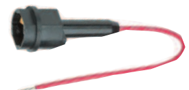
HLR Fuse Holder