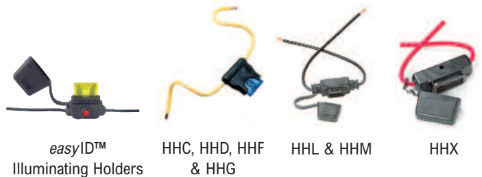
easyID™ Illuminating Holders