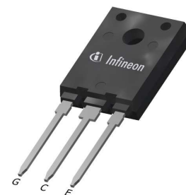
Fully isolated package TO-247