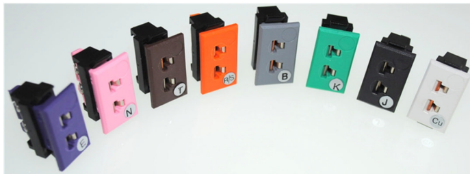
'Panel mounting sockets'