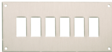
'6 Way panel for miniature fascia sockets'