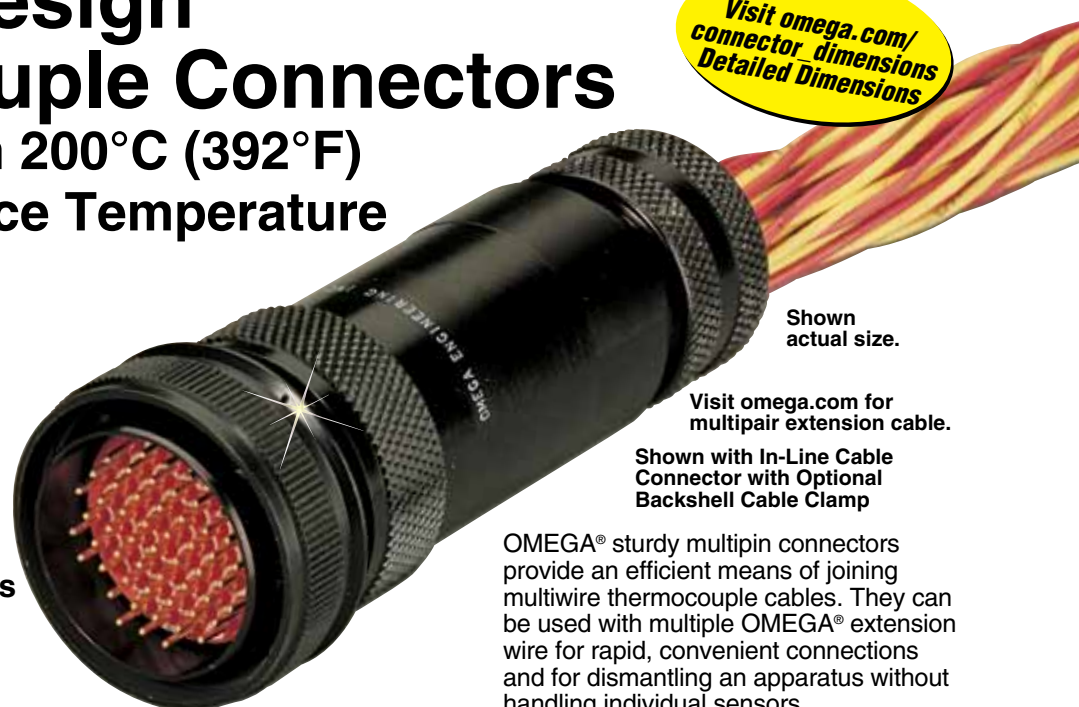
Shown actual size.

Visit omega.com/connector_dimensions Detailed Dimensions