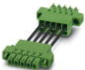
Spare local bus cable, for INTERBUS-ST modules