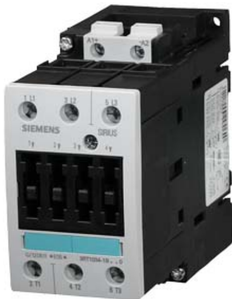
CONTACTOR, AC-3 18.5 KW/400 V, DC 24 V, 3-POLE, SIZE S2, SCREW CONNECTION