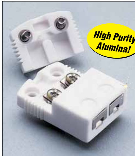
SHX Series Basic Male Connector

SHX subminiature connectors are ideal for use with fine gage thermocouple wires in applications where high temperatures are required. The SHX connector is permanently dot-coded to conform to ANSI and OMEGA standards; for applications such as high vacuum furnaces where contamination would adversely affect the process, USHX connectors are shipped with a removable color-coding dot. Two-piece ceramic construction assures long life, while the oversized terminal screws allow for easy wiring.