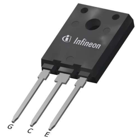
Fully isolated package TO-247