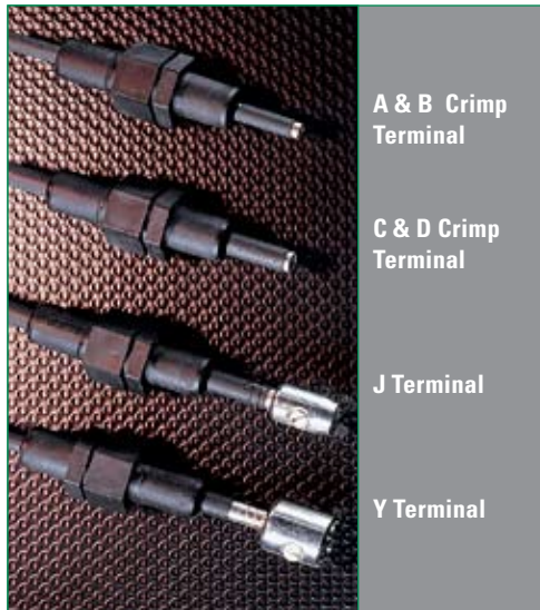
A & B Crimp Terminal